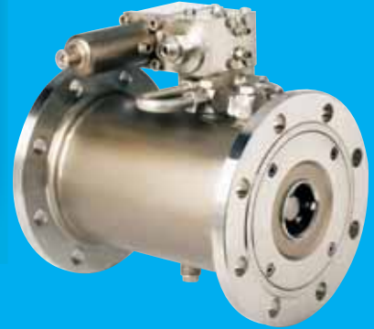
Back Pressure Regulator