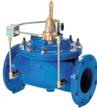
Pressure Reducing valve