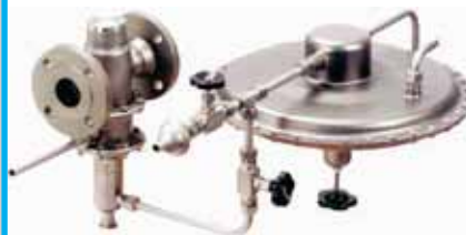
Millibar Control Valve