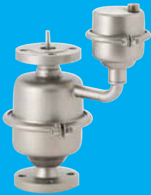
Bleeding & Venting Valve